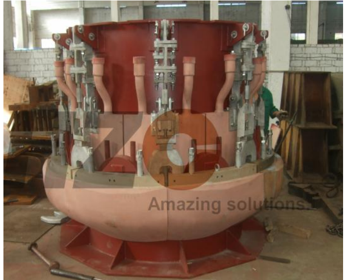
SAF assembly site