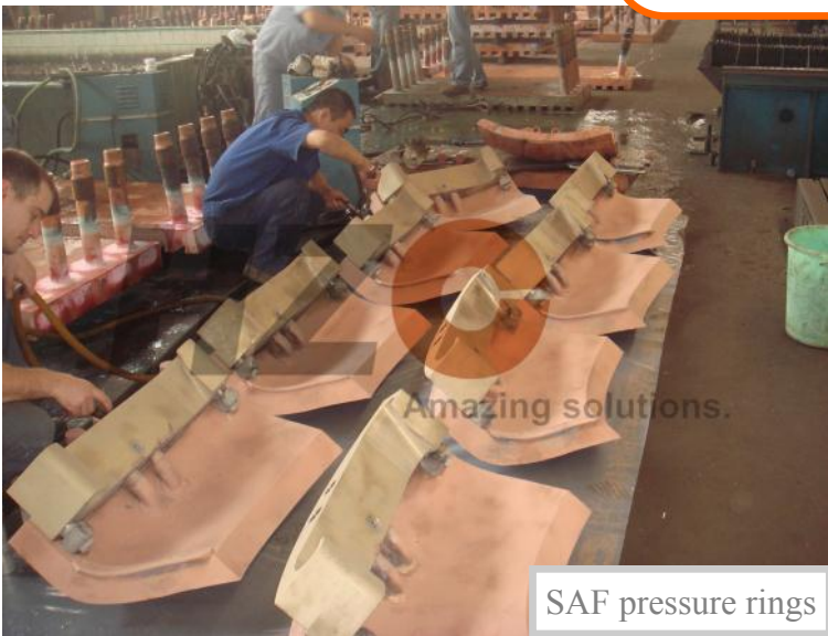
SAF pressure rings