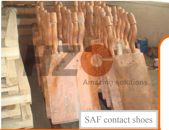
SAF contact shoes