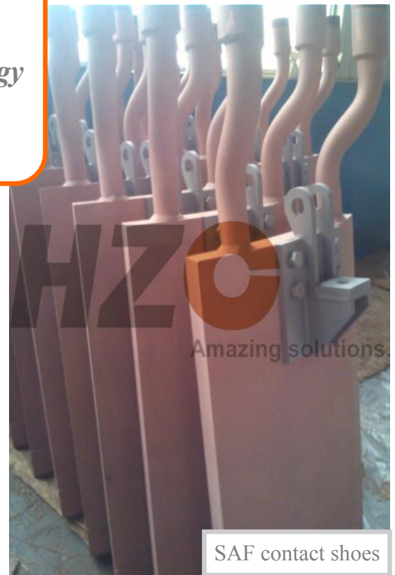
SAF contact shoes